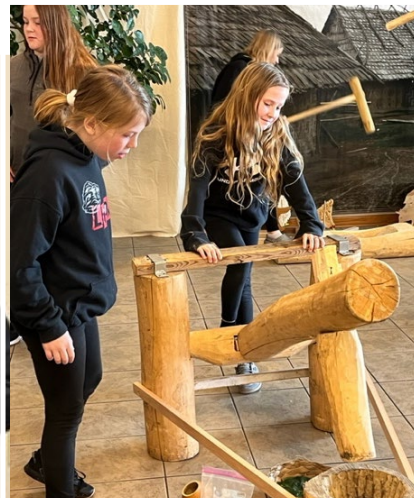
4th and 5th Graders visited the Hmong Cultural Center in La Crosse Friday, March 24