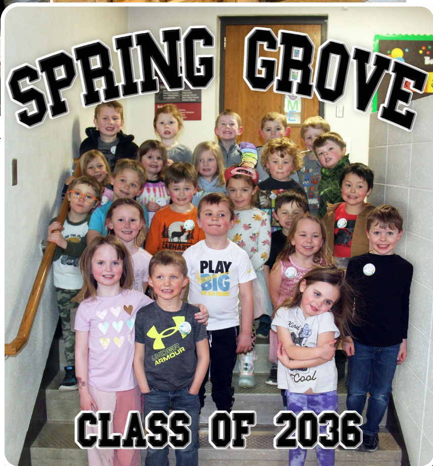
Kindergarten Round-up was held Wednesday, March 29. Looking forward to seeing these smiling faces in the fall!

*in Spring Grove it will be the beginning of the 2023-24 school year, there is no summer food service